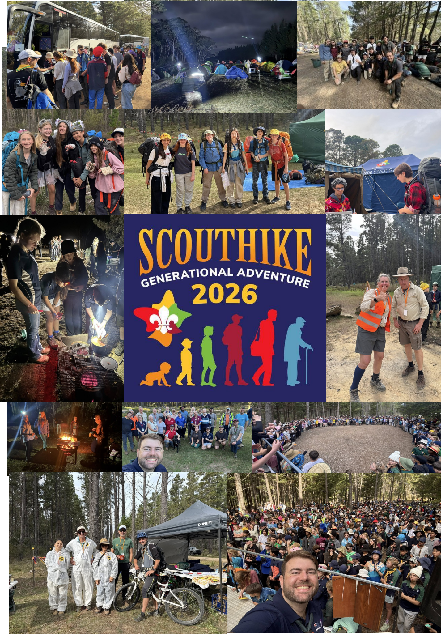
Sydney North Region Annual Report 2025/2026