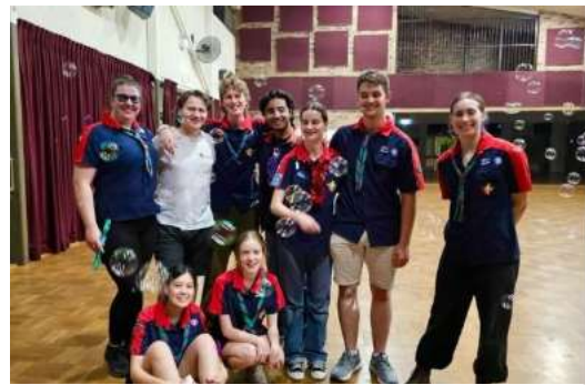
Photo 4: Running the Berowra christmas night markets to raise money for the black dog institute.