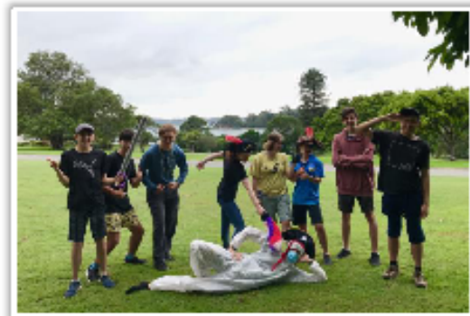
2 nd Gordon Rover and Venturer Crunit

However, there could only be one winner. So, a big congratulations to the Crunit from Forest Rovers and Belrose Venturers who took out the win!!