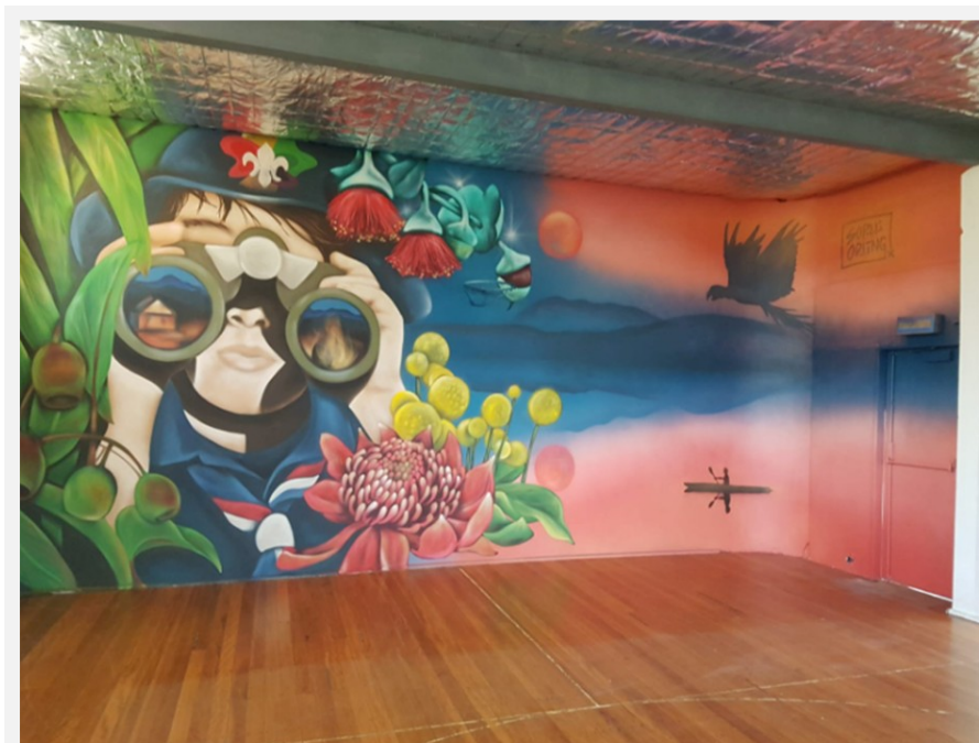
After three days the wall is transformed