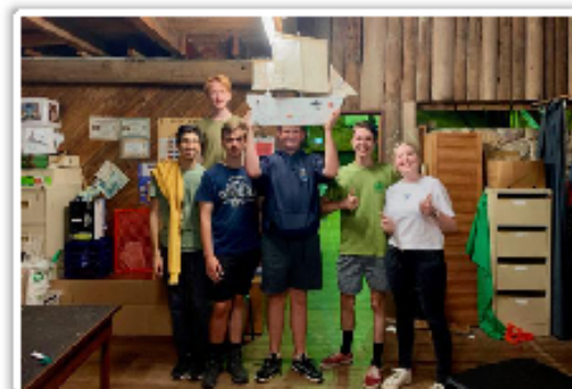
The winning team from Forest Rovers and Belrose Venturers with their pirate-themed skin

But what if you missed out on this awesome day? Not to worry, I am sure that Roventure 2022 will be just as incredible! Will the organising Crew continue the Voyage for a Vaccine theme? Or will they come up with their own crazy idea? Make sure to keep in touch with your linking rover crew and stay tuned for more info coming in 2022!