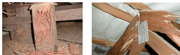
Termite Damage, can be Below Floor Level and Inside the Hall Roof,

If unsure on a section of the P10 Form – Please consult your DC.