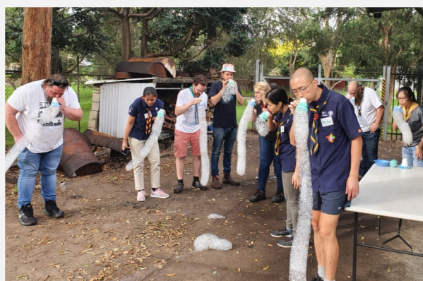
Bubble Cups are always a big hit with kids of all ages!