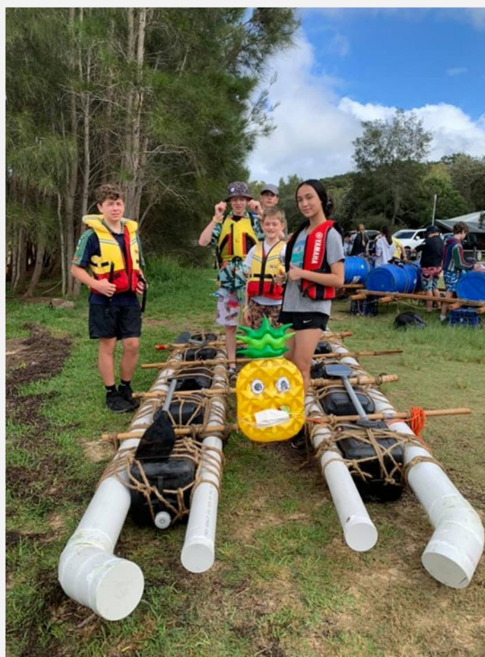
2nd Gordon—Infected Pineapples