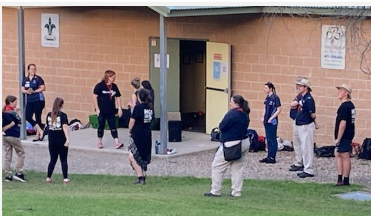
Gang Show rehearsing safely at MCMK

their large combined hall in a fantastic location with indoor and outdoor areas to spread the cast. Add the benefit of being conveniently located next door to a Council facility that provided even more space and the Scouts and Guides of Hornsby Gang Show are excited with the show that is coming together. Without this generous support of Mount Colah/Mt Kuring-gai Scouts and Mt Colah Guides the job of preparing the cast for the 2021 season would have placed a significant burden on the production and support teams. Hornsby Gang Show would like to acknowledge both of these groups and give a big "BRAVO" to thank them for their unwavering support.