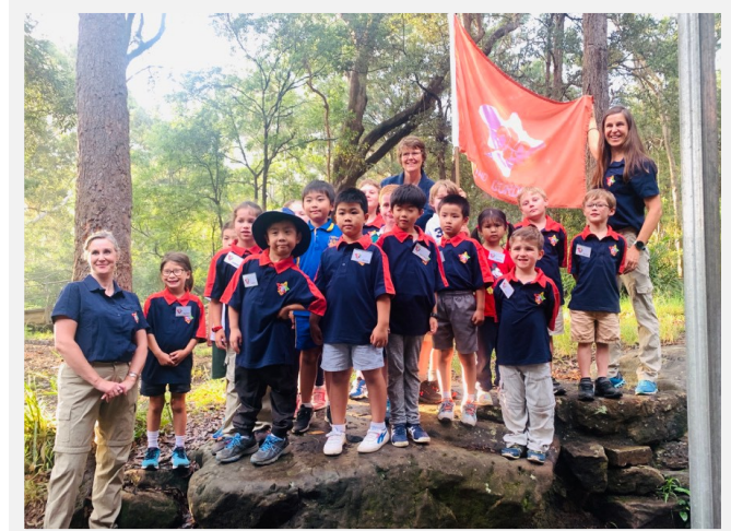
Our new Joey flag being displayed with pride

We've had invaluable help from the 2nd Gordon Cubs each week. And we're soon to go from 3 leaders to 4 meaning we'll be able to take on a few more Joeys from the waiting list.