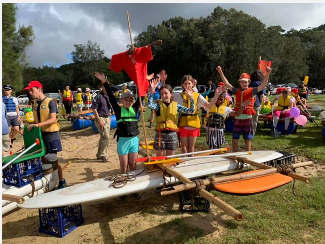
2nd Turramurra—Submarine Crew

The day ended with sunshine and many happy Scouts, Leaders and parents.