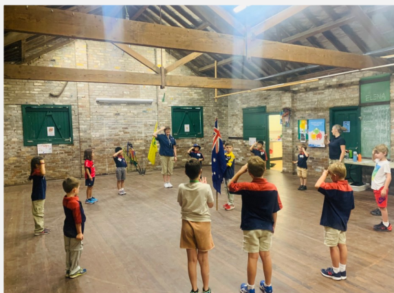
Flag Parade is serious business